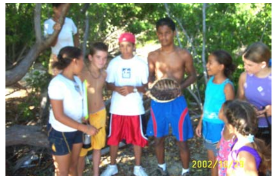
Culebra kids disappointed to find bloody juvenile hawksbill shell.

illegal practices threaten the patrimony of the Culebrenses as much as they threaten the future of the species. Don't purchase turtle related products such as shells, meat, oil, or eggs. Report all poaching to 787-724-5700, there is a reward for information that leads to a conviction.