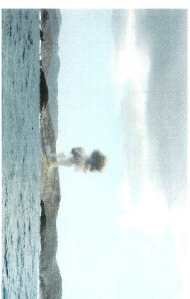
Unexploded Ordnance Detonation

In 1975, surface and aerial bombing of Flamenco Peninsula and surrounding cays ended. Although, the peninsula has been swept for UXO, a substantial amount of dangerous UXO still exists in all former target areas.